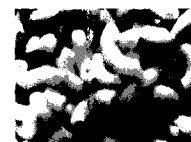
Mac and Cheese