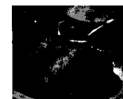
Chicken Tenders (2 pc.) PB & J